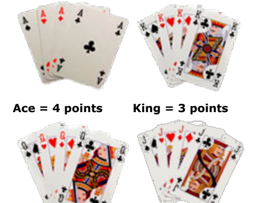
Queen = 2 points Jack = 1 point

The value of the hand is worked out by counting up the high card points held, using the following scale: